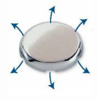
THE HYDROTHERAPY JETS

The image below shows the air jets, you will notice the air comes out of 6 holes around the RIM of the jets. This means the system can deliver very high pressure pulses of air, without drilling holes through you. The control pad in the bath, allows you to control the pressure and the pulse rate to fit your individual needs.