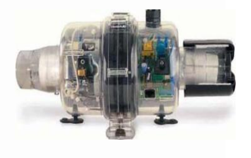
THE HEART OF THE SYSTEM