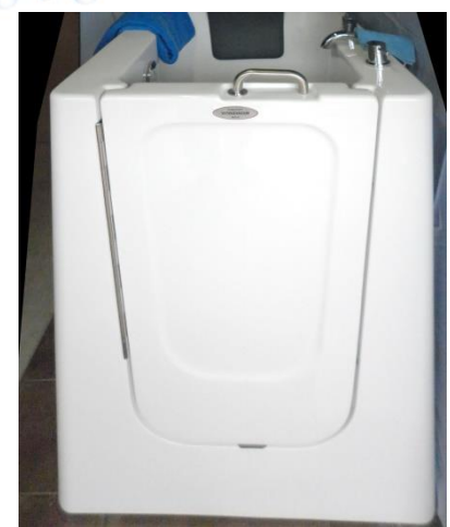
RIGHT HINGE MODEL, DOOR OPENS OUTWARD