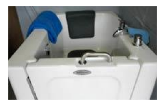
THE HANDLE ON THE DOOR TURNS, AND INSERTS THE DOOR PINS [SHOWN BELOW] INTO THE BATH FRAME